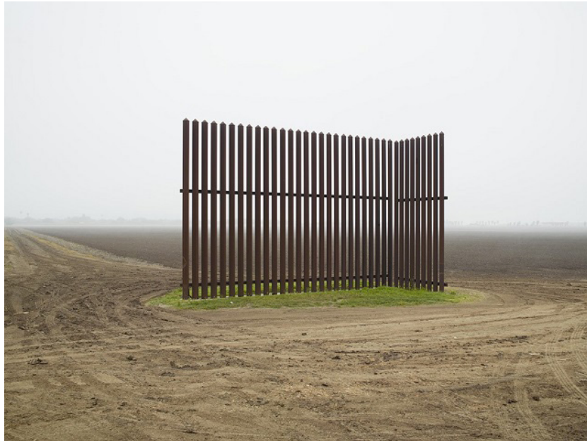
▲ Richard Misrach, Wall , Los Indios, Texas, 2015, printed 2017 from an edition of 5, pigment print, 61 1/8 x 80 3/4 x 2 1/8 inches, Crystal Bridges Museum of American Art, courtesy of the artist.