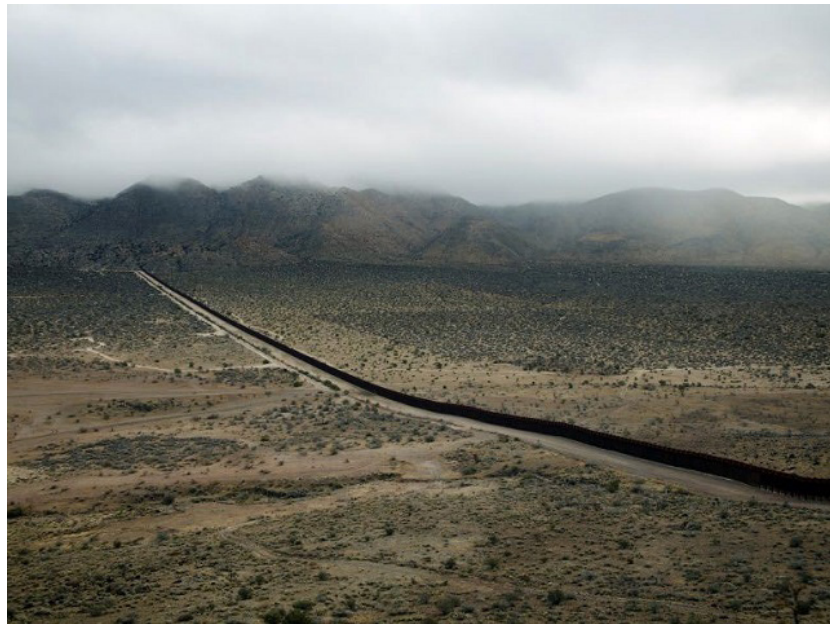
▲ Richard Misrach, Wall , 2009, El Muro, Jacumba, California, pigment print, 60 x 80 inches, courtesy the artist.