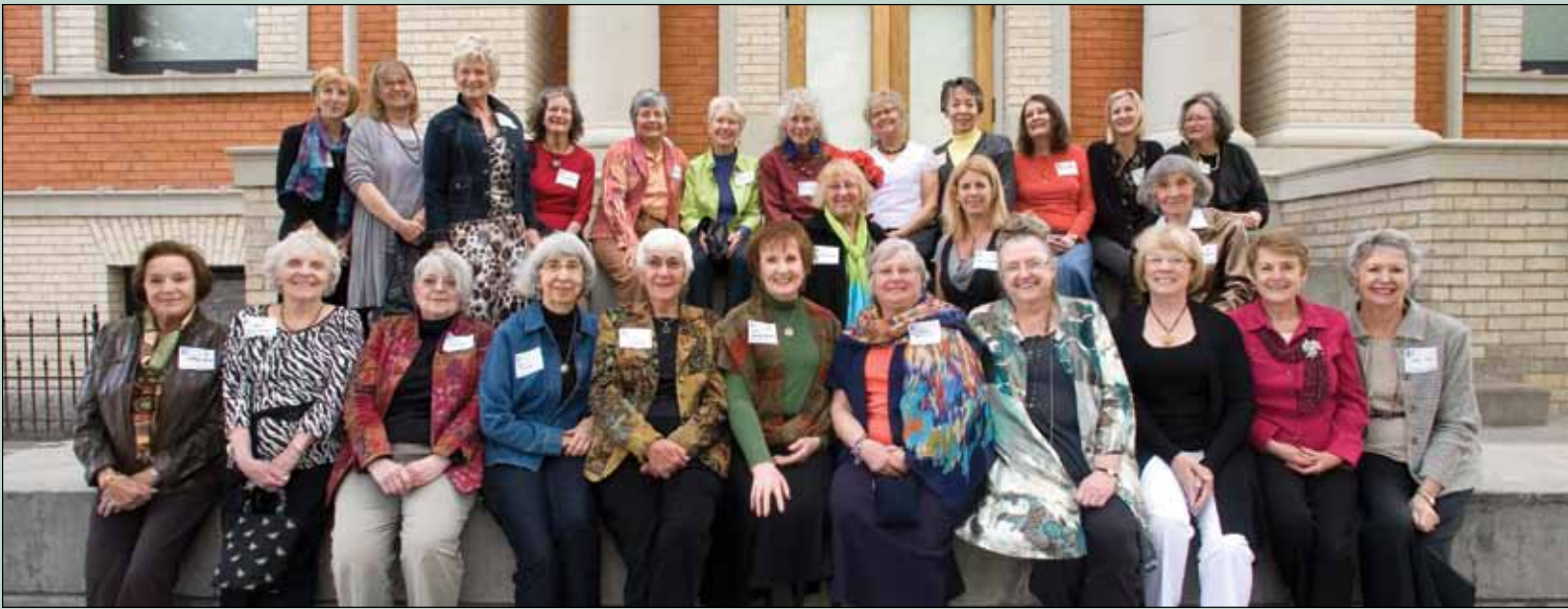
MAM Award 2012 Recipient: Art Associates of Missoula ▲