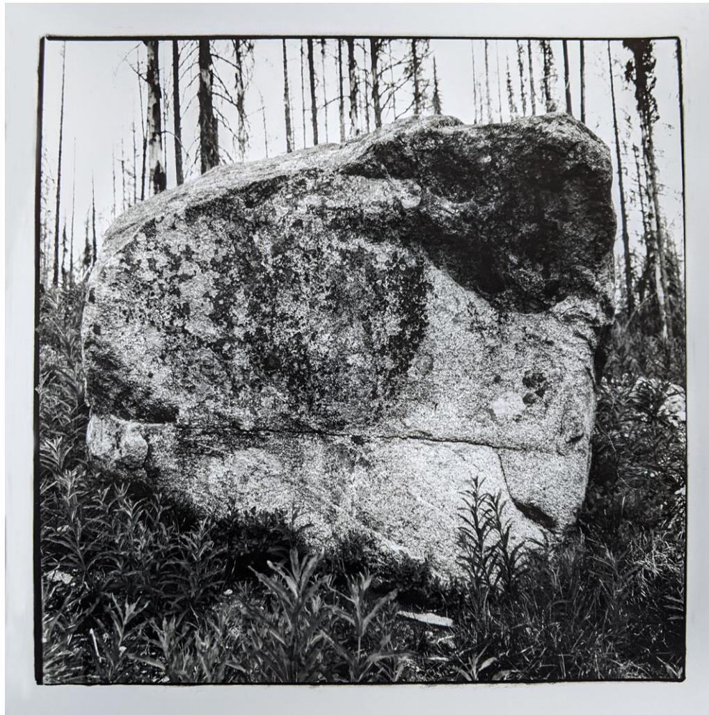
Figure 2: Polygon , silver gelatin print, 2020.